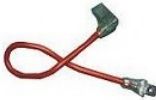
5001 187 pin型端子/187直端子